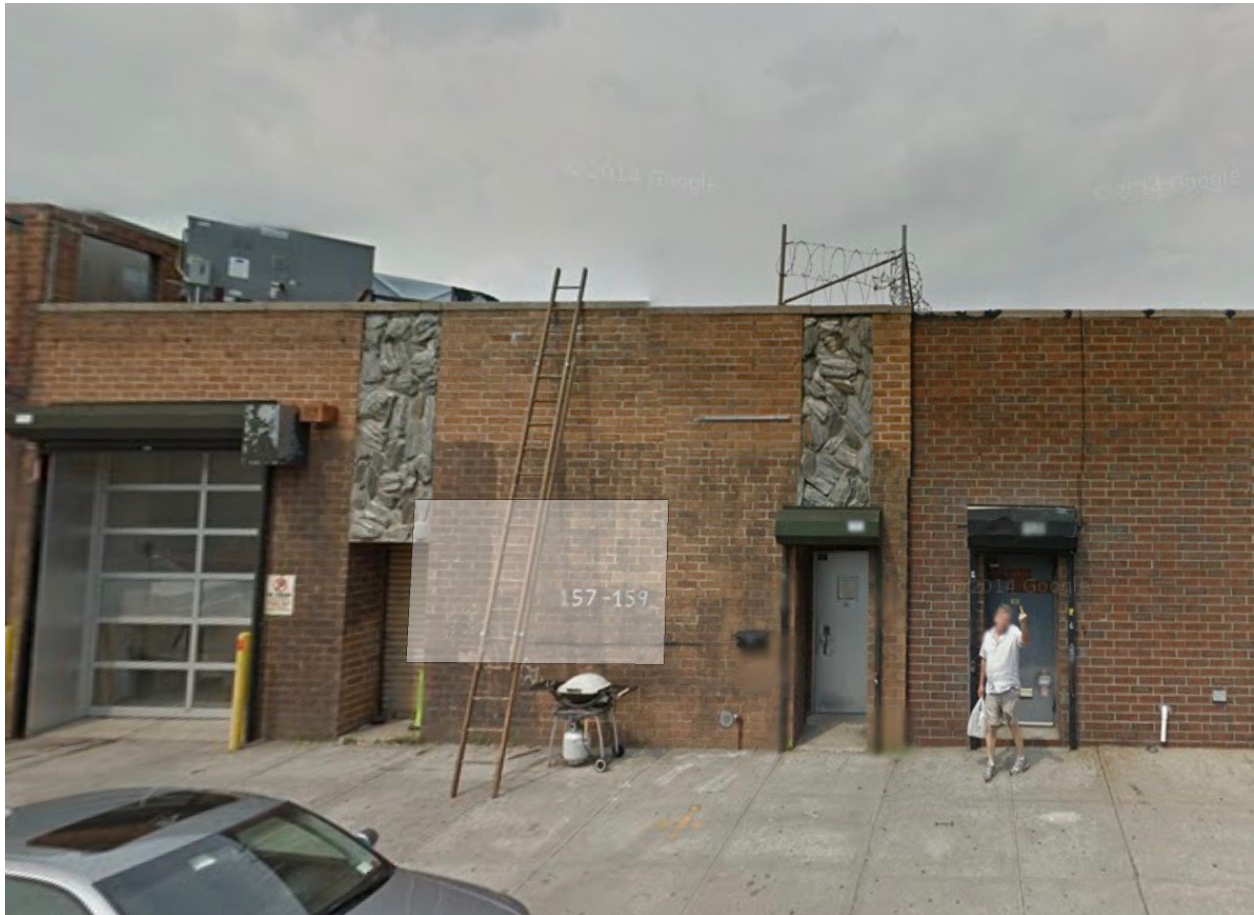
A Google Maps Street View of the Brooklyn Shop.

metal door with a small glass window installed at or around eye-level. Fashioned above each door was a metal awning containing rolling metal security shutters.