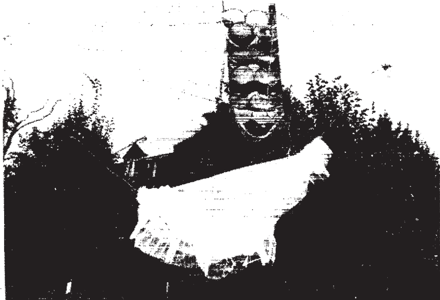
Yo Momma's dirty laundry.