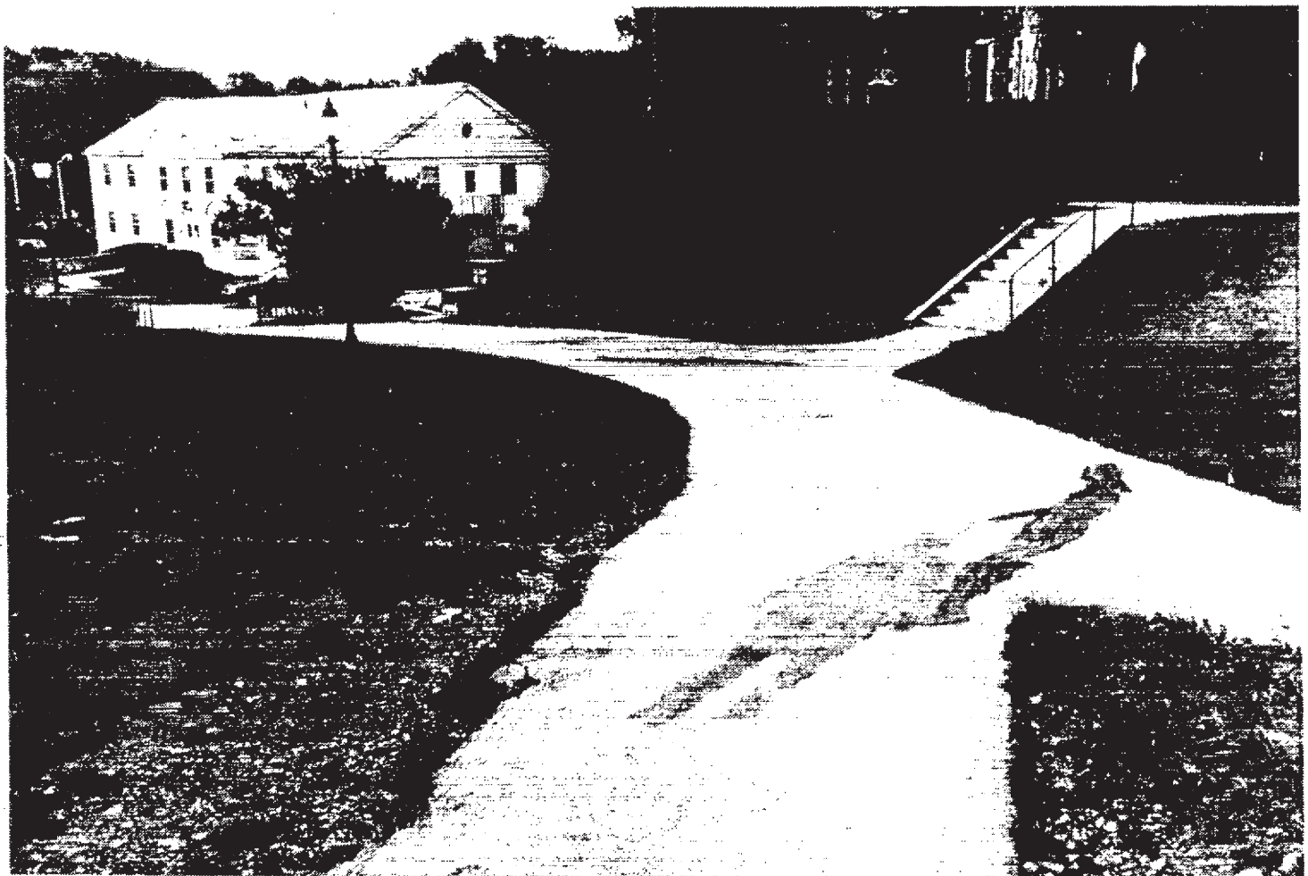
Bard campus, shadowed by Operation Art (story on page 4).

Notebook, page 2 Security, page 2 Dezego Interview, page 5