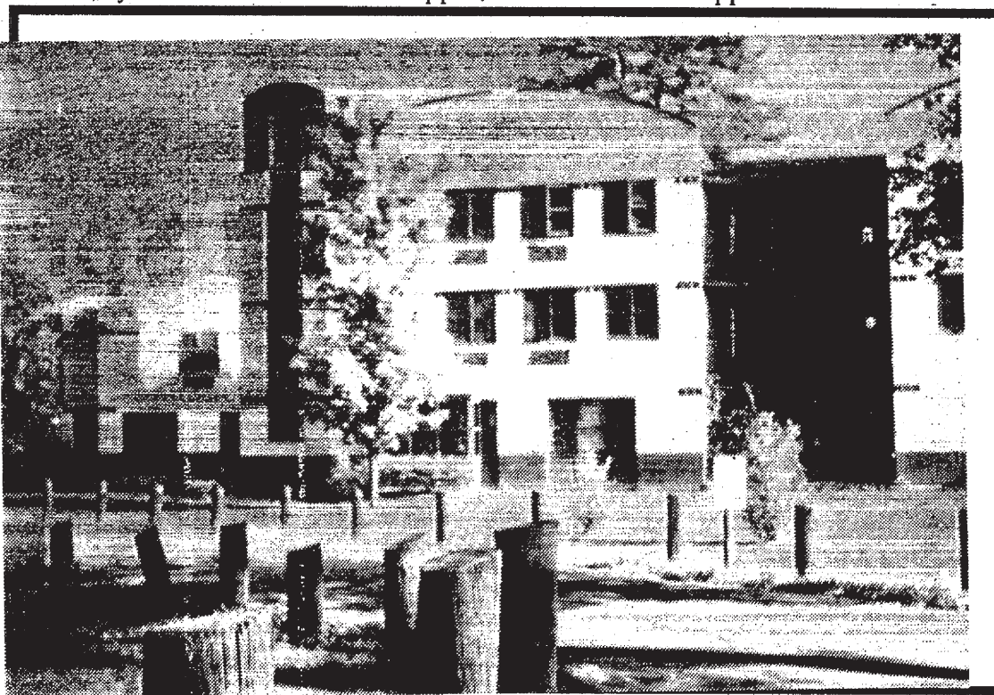
Rueger Dorm File Photo

As the sun was rising over the lush green landscape surrounding the Ravines, they returned; tired but satisfied. They hadn't solved the problem of homelessness, but rather than turning away at the sights and sounds of the homeless, they provided the means necessary to survive another night on the street.