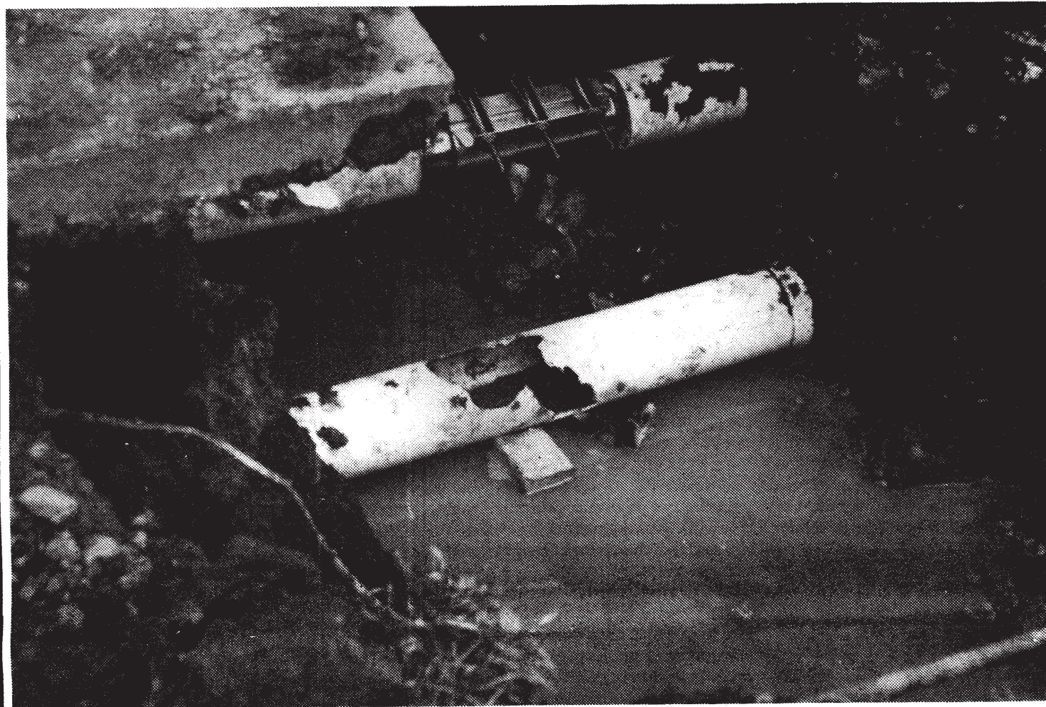
A broken water pipe outside the Alumni Dorms last semester

Letters: Unfair housing practices, is a postal rate increase unethical?