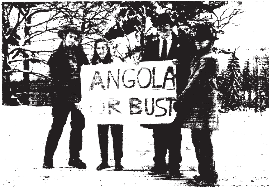
Peace Corp or CIA: Your Choice. Corp or Company, your choice.

You know the Peace Corps has been successfully helping people in underdeveloped countries for over twenty-five years. But did you know that a stint in the Corps can help reduce college loan debts? Due to the Student Loan Forgiveness provision of the Higher Education Act of 1986 (effective as of July 1, 1987), authority for the Peace Corps and VISTA to authorize cancellation of National Direct Student Loans was established.