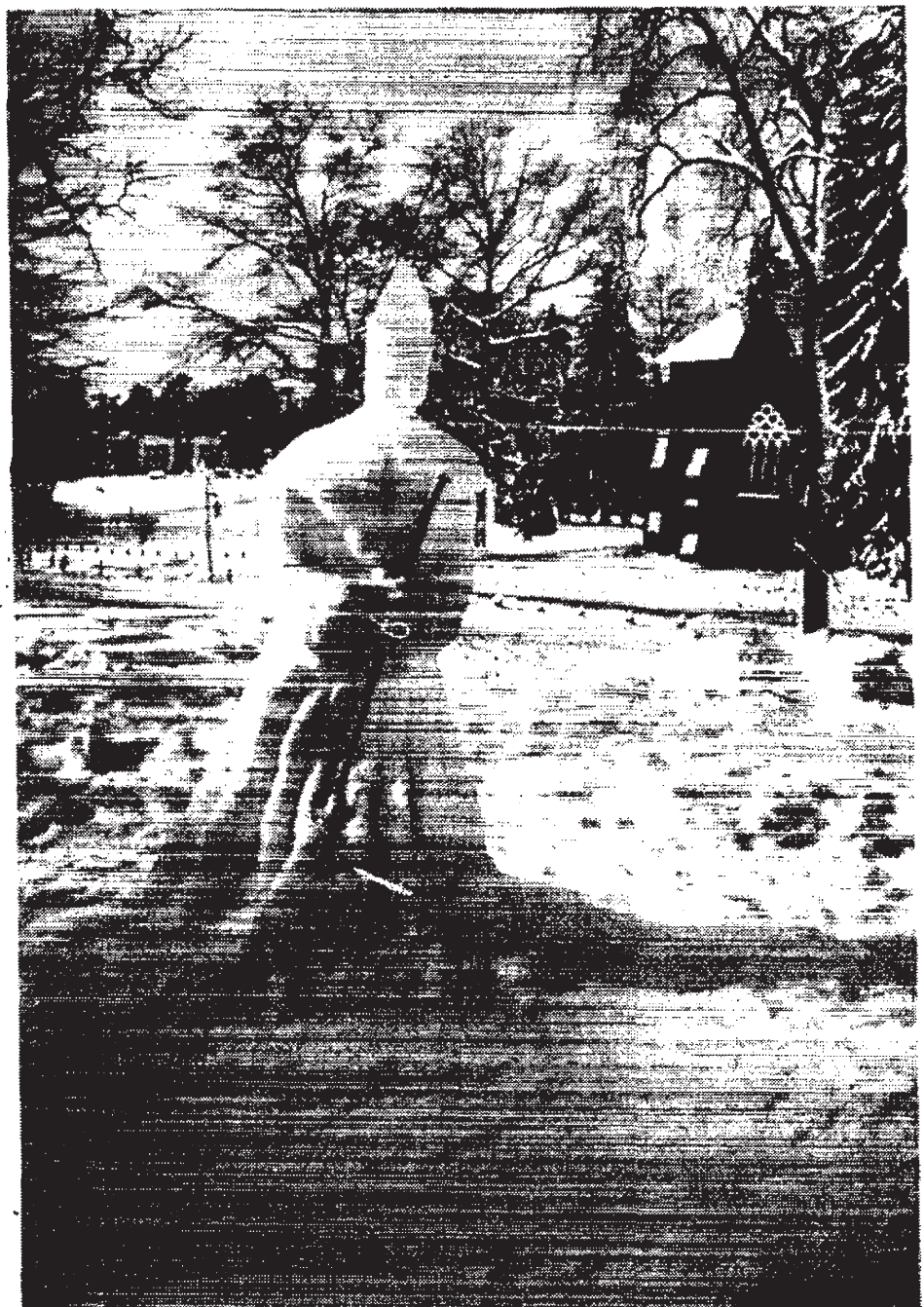
Ice Artists on the Move.