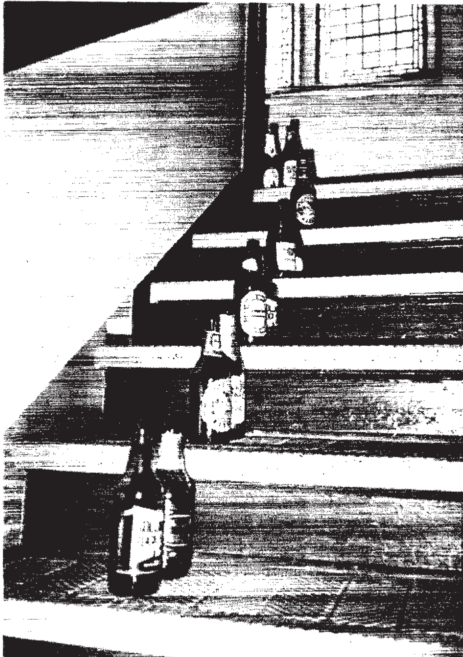
Stairway to Heaven???

Are you in a constant state of indebtedness? Do credit card companies have hitmen after you? Do you owe money to long-toothed men with names like Guido and Cheech? If so there may be help for you. Although they won't give you money to support your credit lifestyle, the Self-Help Clearinghouse in Ulster County is interested in starting a support group for anyone who has a problem with money. The group will be based on Debtors Anonymous model and will adhere to the Alcoholics Anonymous 12 Steps and 12 Traditions.