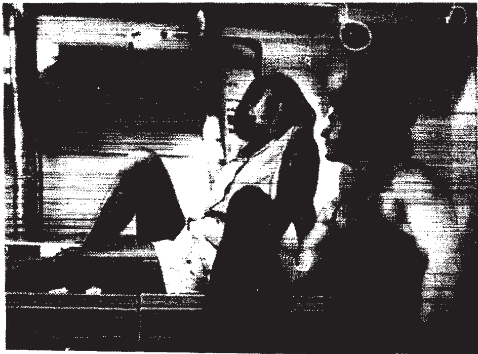
Wash Him — Washer.

Take the Taconic north to the Mass. Pike. Take the Mass. Pike east until you hit Boston. Keep going. Keep going. See the sign that says "Chinatown"? Turn now!