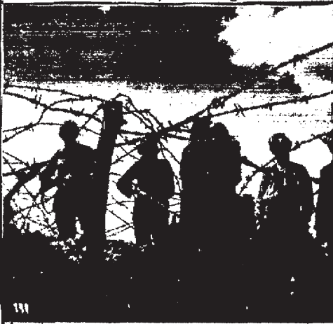
Prospective students at I.D.P. seminar