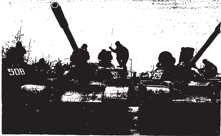
B&G Personnel Manning New Equipment

Dateline: Physical Plant, Bard College May 6, 1978.