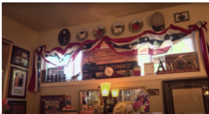
'Trump's Housewives | Unreported World'