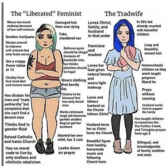
Reddit u/NsaneATheist Screenshot from Reddit

Now that we have established a precedent for this kind of thinking, let us return to the modern example of this trend. Within the image, each figure is surrounded by phrases meant to describe the lifestyles they uphold. Around "The 'Liberated' Feminist" are phrases such as "sleeps around to improve self esteem but only feels worse", "has disdain for men and 'male patriarchy' but complains that she cant find a decent man", "thinks god is gender-fluid" and "aborted her own child, has 3 cats" 34 . The tone and overall wording of the way the feminist charater is portrayed within this dichotomy is essentially completely negative and shames this (theoretical) woman for her appearance, sexuality, and religious beliefs, as well as many other components of "her" identity. Conversely, the character meant to represent the tradwife has largely positive attributes listed. Some of these include "Loves and follows husband as the Church follows Christ," "Homeschools children so they aren't taught progress liberal bs" and "In