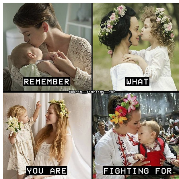
Instagram @western_aesthetics . Screenshot from Instagram.

If this page was promoting a singular heritage, like a Swedish or German background, it would not carry the same connotation. What we see happening here is the vast amalgamation of ‘European Heritage’ which, reading between the lines, means ‘white heritage’. Images of