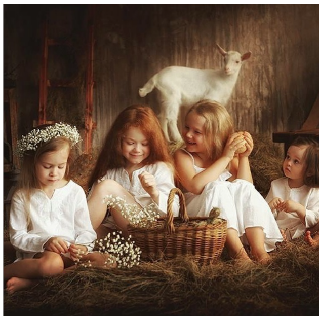
Instagram @european_folk . Screenshot from Instagram

If you were to scroll through Caitlin’s Instagram as of March 2021, you would be witness to a multitude of various accounts she follows that underline the assertion that Mrs. Midwest holds white supremacist and alt-right beliefs. @worth_fighting_for , an Instagram page self-described to be ‘traditional aesthetics’, is one such page. The content on this account is broad, including text posts for male self-improvement, physical fitness, and the rejection of modern culture. Most prominently featured are paintings and photographs of white people and families, along with pastoral landscapes and European architecture. The name of the account begs many questions; Fighting for what? Against who? What kind of fight?