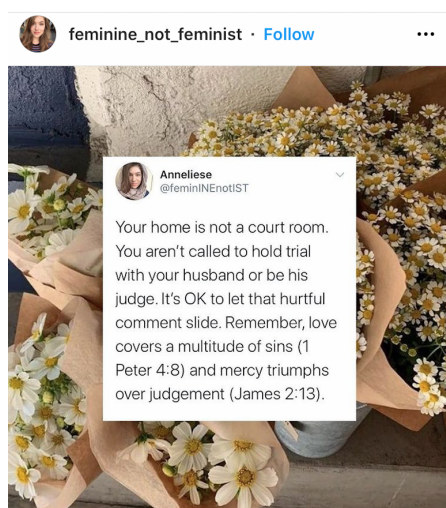
Instagram @feminine_not_feminist.

Outside of explicit references to women's roles, there are also many metaphorical allusions of this same theme. A recurring image that we see within the Bible is Jesus as the 'Bridegroom.' This metaphor is present in all four Gospels, the Hebrew Bible, and additional New Testament books. One of the most well known of these references is within the Book of Revelation, which states "Let us rejoice and be glad and give the glory to Him, for the marriage of the Lamb has come and His bride has made herself ready." 63 Within this context, Jesus' bride is the city of Jerusalem, representing humanity. By situating Jesus as "Bridegroom" in this metaphor, and throughout the text, the "bride" is naturally placed in a position under God. Applying this understanding, we can notice how the bridegroom could be seen as above the bride, as God is 'above people,' and how this could translate into an unequal power dynamic within an earthly marriage.