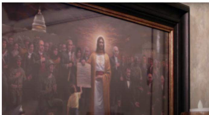
'Trump's Housewives | Unreported World' Screenshot from Youtube.