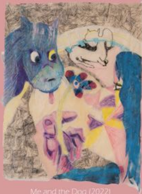
Me and the Dog (2022) (measurement) Mixed media collage on rice paper

@ UBS Bard Exhibition Center 7401 S Broadway, Red Hook, NY April 9th, 2022 3 to 6pm