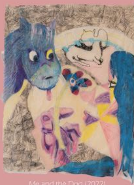
Me and the Dog (2022) (measurement) Mixed media collage on rice paper

@ UBS Bard Exhibition Center 7401 S Broadway, Red Hook, NY April 9th, 2022 3 to 6pm