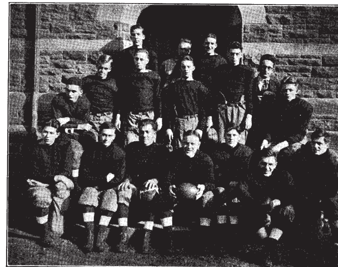
The Football Team of 1919-1920. Help Support Athletics at St. Stephen's