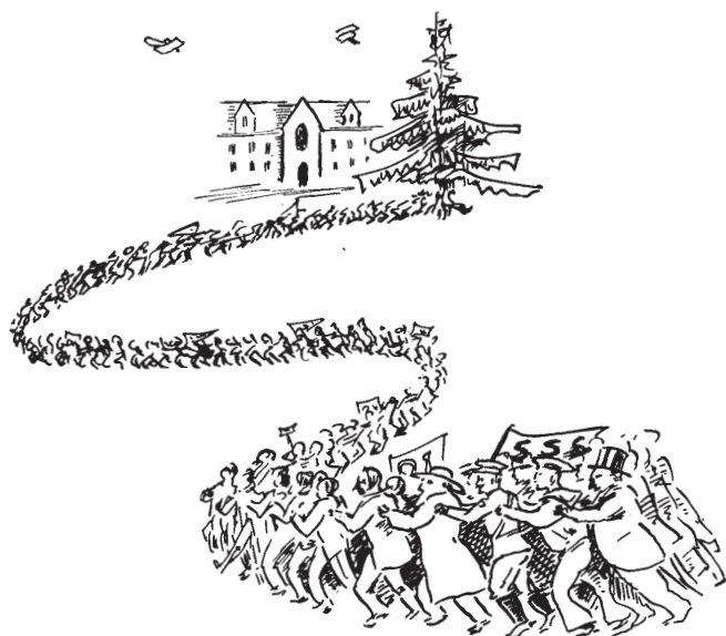
JOIN THE BIG CROWD UNDER THE LYRE TREE

Patron (brilliantly): "Oh, yes. Cut." —Hamilton Life.