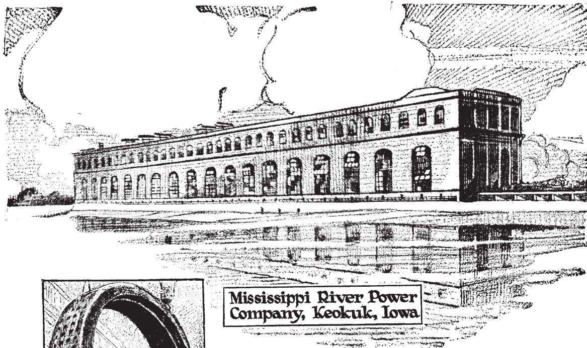
Mississippi River Power Company, Keokuk, Iowa