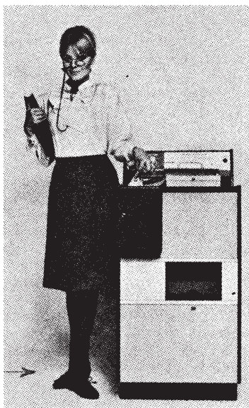
The Library's New Copy Machine

Students were welcome to ask questions later in the evening and many did.