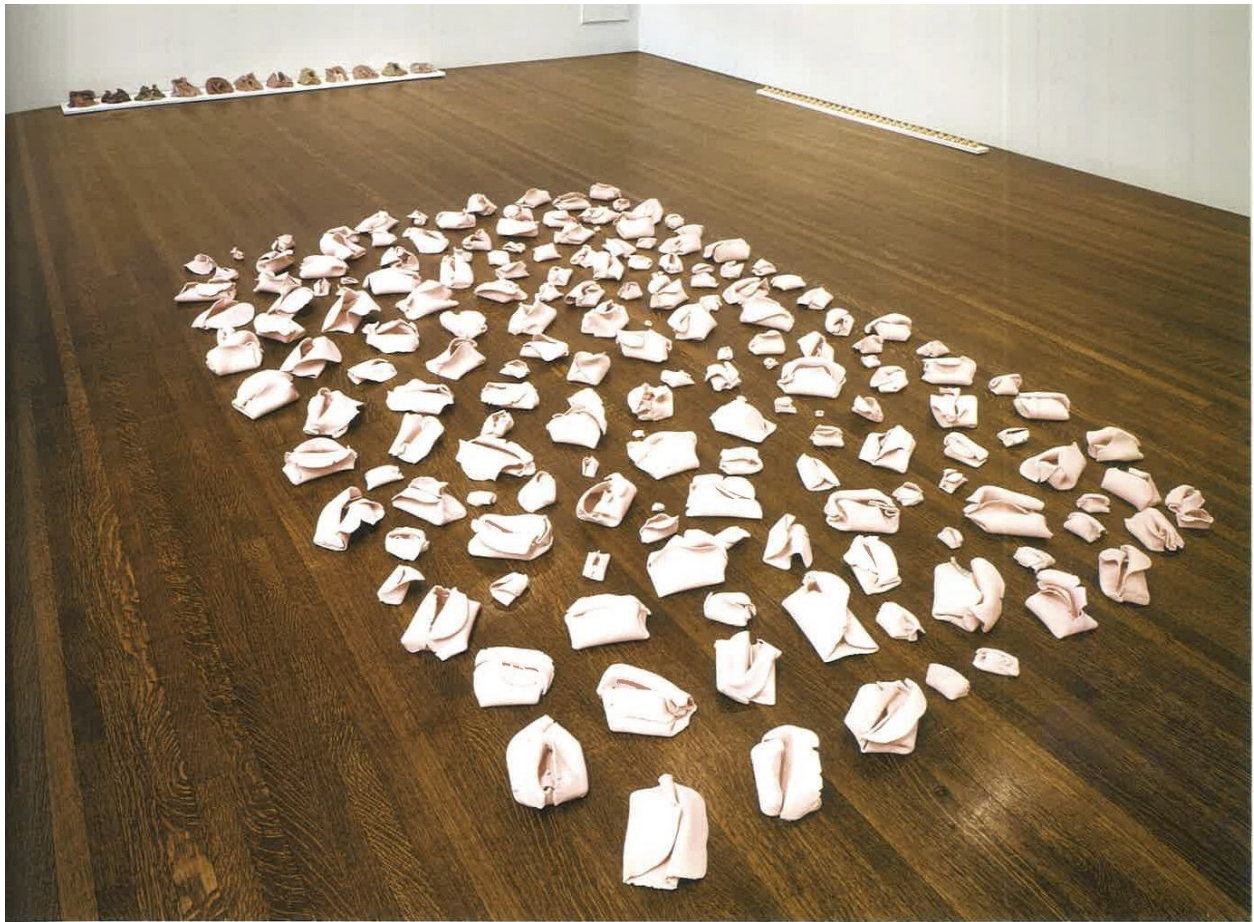
Figure 2: Hannah Wilke, Installation view; foreground: 176 One-Fold Gestural Sculptures, 1973-74. Painted Ceramics, 72 x 96 in. Background, left: Laundry Lint [C.O.'s] 1973. Twelve sculptures, double-fold lint, dimensions variable, overall installation 11 x 96 in. Hannah Wilke Collection & Archive, Los Angeles. Background, right: Fortunate Cookies, 1974. Fortune cookies, dimensions variable; no longer extant. Scanned from Nancy Princenthal and Hannah Wilke. Hannah Wilke . (Munich: Prestel, 2010).