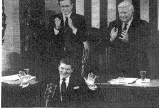
President Reagan is applauded by Vice President Bush and Speaker Thomas P. O'Neill Jr. during his State of the Union address last night.