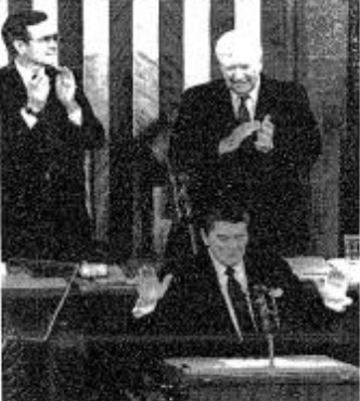
President Reagan acknowledging applause before delivering his State of the Union Message. Vice President Bush, who is President pro tem of the Senate, and Thomas P. O'Toole Jr., the House Speaker, are visible.

Mr. Volcker's testimony was the strongest on far about the problems, the Administration will face if it fails to act on the deficit.