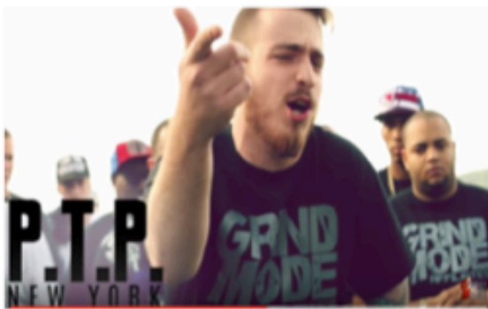
Grind Mode Cypher, NY Edition Vol. 2, P.T.P