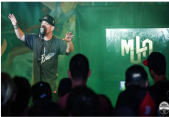
TeamBackPack's Mission Underground 2015

Now, you may be saying “Wow, thanks Pete, that’s a ton of info, but what gives?” My hope is that the preceding details of some observed cypher formats act as a taxonomy of variations that situate the reader in a broader context of Hip-Hop cyphers in order to engage further with the ideally more principled space of the Hip-Hop Cypher . By understanding the original format of the participatory cypher, then how it is packaged as presentational or performative cyphers in media, one can further ascertain the aspects of the participatory cypher that these brands and formats are trying to elevate and simultaneously commodify. Individual skill, the one-mic policy of the cypher, the Cypher