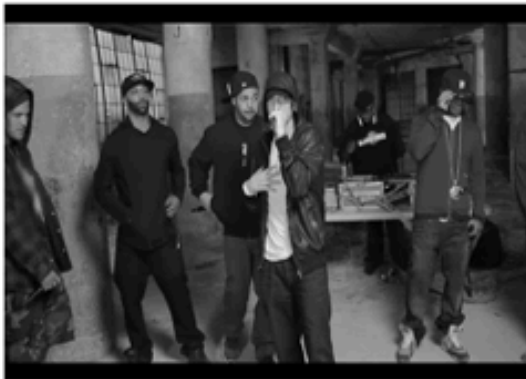
BET Cypher 2014, Eminem, Slaughterhouse