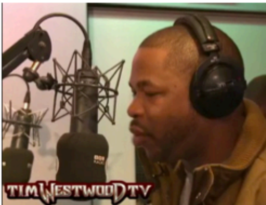
Xzibit, TimWestwoodTV, BBC Radio One, 2010