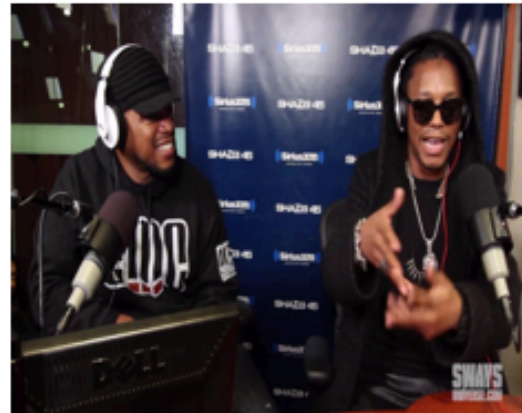
Lupe Fiasco, Sway in the Morning, 2014