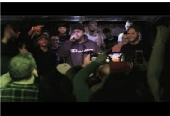
Grind Mode Cypher Featuring Joell Ortiz, 2015