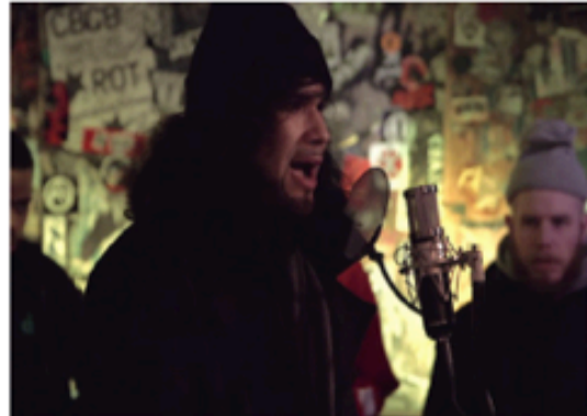
TeamBackPack Cypher, Final Outlaw, 2015