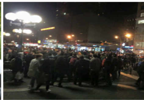
Legendary Cyphers, NYC, 10/23/15