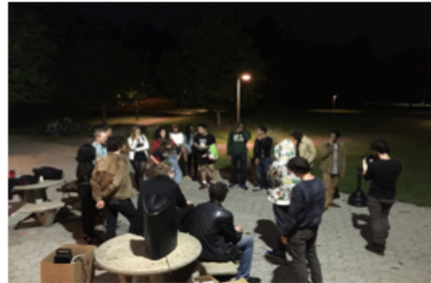
Bard Bars, Bard College, 9/25/15