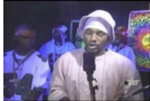
The Diplomats on Rap City, 2003