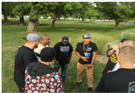
Grind Mode Cyphers, Croton Park, 9/27/15