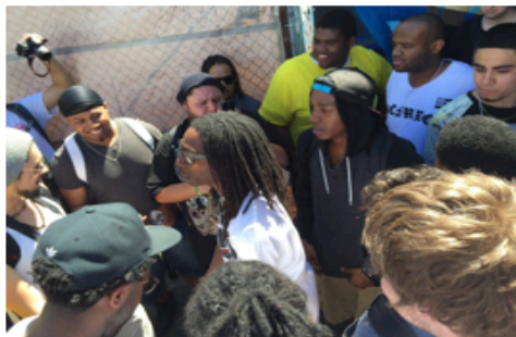
TeamBackPack's Mission Underground 2015

cyphers that occur outside of Hip-Hop events like TeamBackPack's Mission Underground and the Grind Mode Cypher.