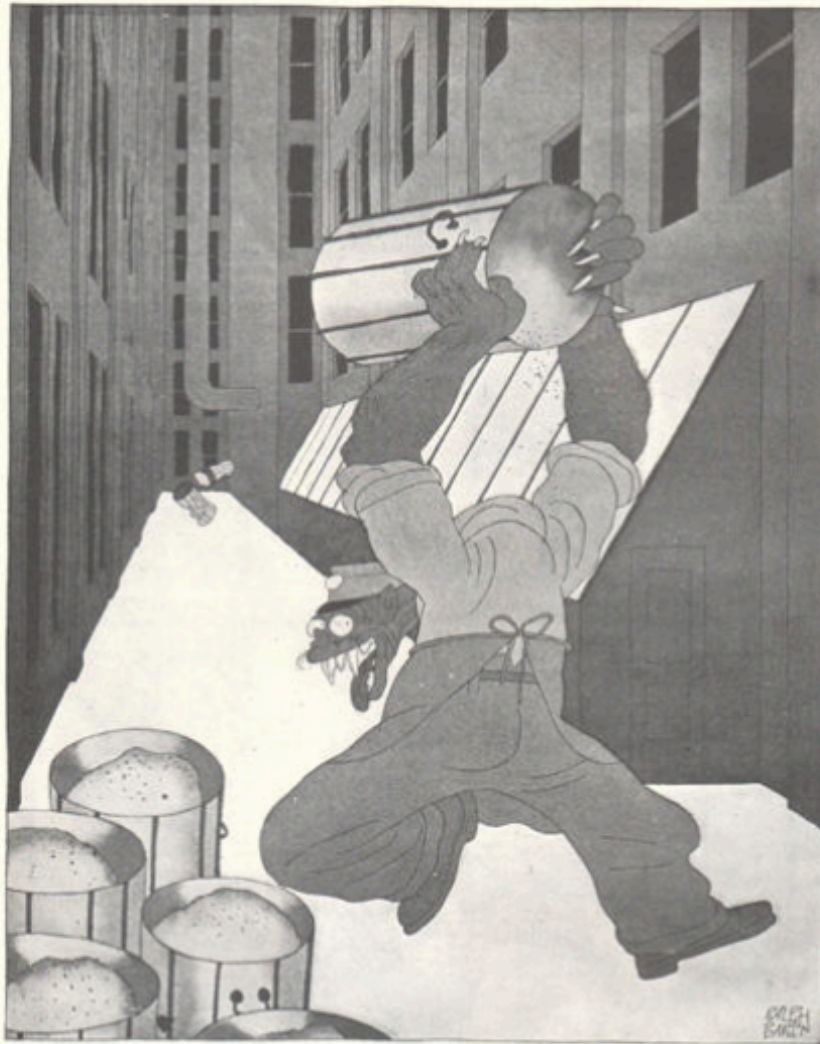
THE SORT OF THING THAT BRINGS JOY TO THE ASHMAN'S BLACK HEART A WHOLE, NICE, NEW, BIG, TWENTY-STORY, CO-OPERATIVE APARTMENT HOUSE TO WAKE UP AT SIX IN THE MORNING