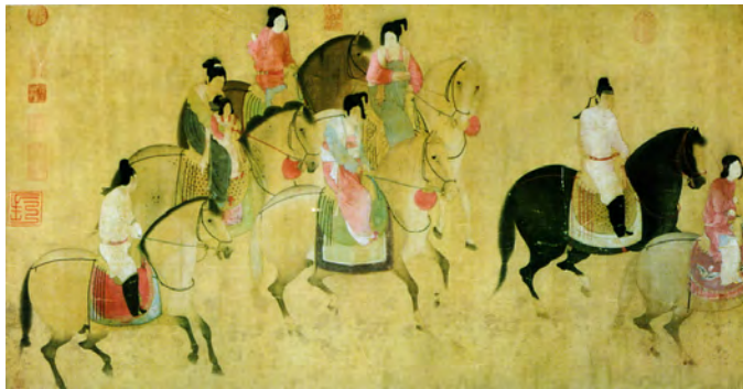
Figure 8, Lady Guoguo on A Spring Outing , by Zhang Xuan, 51.8 cm high, 148 cm wide, ink and pigment on silk, currently located at the Liaoning Provincial Museum.