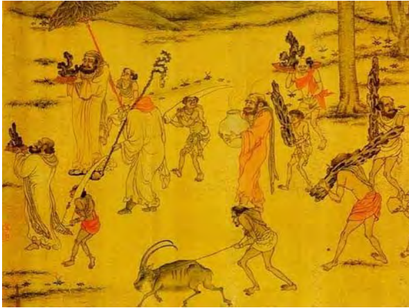
Figure 3, Tribute Bearers , by Yan Liben, handscroll, ink, pigment on silk, 61.5 cm x 191.5 cm, in the palace museum, Beijing

similar to modern-day landscape bonsai. And there are other people in the procession carrying or shouldering exotically shaped mountain rocks. 6 The tribute bearers are each portrayed with different postures and expressions, while the solemn and mighty air of Emperor Taizong provides an appropriate contrast.