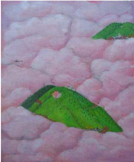
Figure17, Yang Jingsong, Red Cloud 2004.6 (oil on canvas 150 x 190 cm)