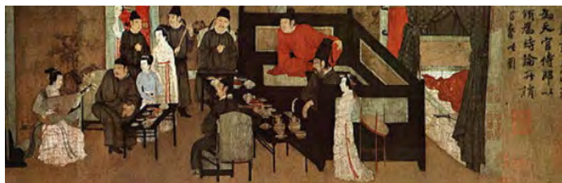
Figure 1.1 The First Section: Han Xizai listens to the pipa. This section includes five women and seven men. The one in red is the Number One Scholar and the man sitting on the bed is Han Xizai.

different sections. In each of the five episodes, Han plays the main actor. The painting is approximately 333.5 centimeters long and 28.7 centimeters tall. The whole painting will be viewed right-to-left. There are 46 people and some of them were appeared very frequently. Using careful observation, all the figures are done vivid with great details and the clothing of all the figures strongly resembles the clothing style of Tang Dynasty. During the revel, Han Xizai always frowns and puts on or takes off his coat for several times. Behind this extravagant and buckish rebel, we could know the really complicated feeling of Han Xizai. He was powerless to fulfill his ideals of reconstructing the country and he chose to evade in the society. This painting has surprising ability to observe and understand of Han's destiny, which makes this painting outstanding and thought provoking.