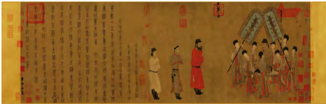
Figure 2, Emperor Taizong Receiving the Tibetan Envoy , by Yan Liben, Handscroll, ink and colors on silk, h: 38.5 cm, w: 129 cm

demonstrated his skills in the painting. The ink outlines of garments are both smooth and vigorous. The figures are shown in various postures against a blank background common to the so-called Monumental figure painting style of the Tang. Done with fine lines the different facial features expressions of the main characters are vivid. Shading is used in some parts of the painting, such as the wrinkles of boots, which gives the painting a strong three-dimensional effect. The painting's color scheme is bright, generous and splendid, featuring large area of red for the costumes and green for the imperial fans, which presents a sense of rhythm and impressive visual effects. 5