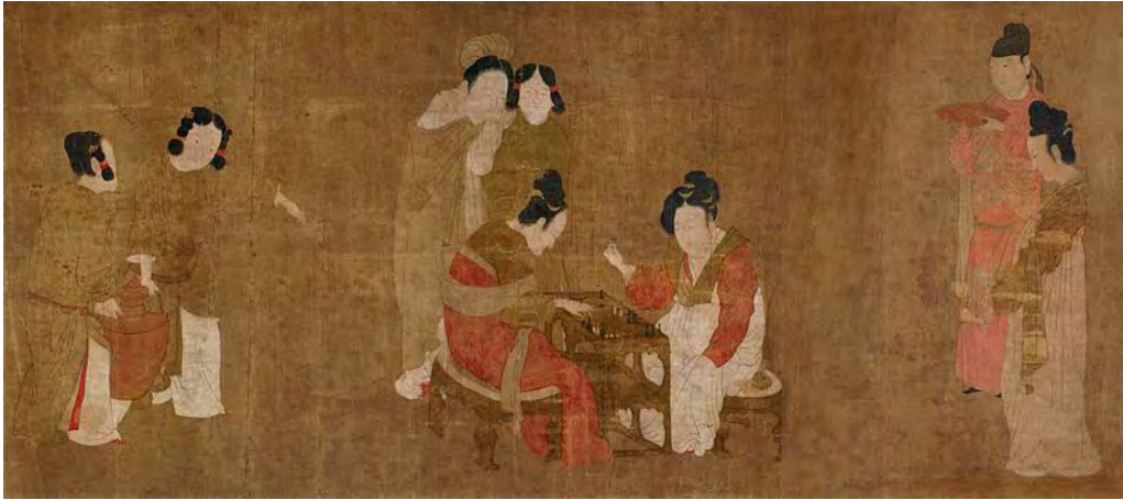
Figure 11. Zhou Fang. Court Ladies Playing Double-sixes. Freer Gallery of Art. Ink and color on silk, H: 30.5 W: 47.6 cm.

In summary figure painting boomed in the Tang Dynasty with an obvious tendency towards depicting real life. Through the use of composition, a variety of lines, like thick thin, short, long curving strokes and some color, mostly red, they described the individuals in their different postures, physical features and facial expression. True to the time, the figures are set against a blank background. In these works, the artists render the figures to illustrate important lessons of history as a model for proper behavior. Many paintings are especially interesting to historians because they help us understand what life looked like in the earlier periods of the imperial palace. Different types of people, different walks of life, different personality, indicate social status.