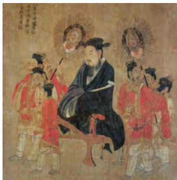
Figure 1.5 Emperor Xuan of Chen, 陈宣帝陈顼