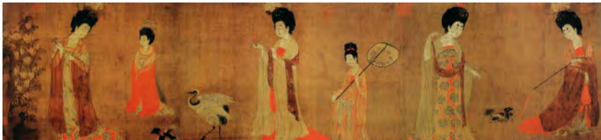
Figure 9. Ladies with Head-pinned Flowers , 46 cm x 180 cm, in the Liaoning Provincial Museum