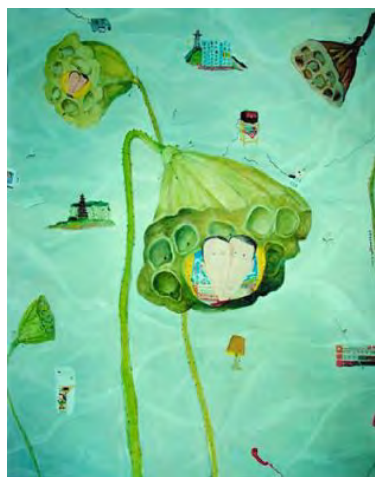
Figure13, Yang Jingsong, Series: Works With No Series

diversity of objects in their apartment. The consumer products are colorfully portrayed in minute detail. 49 In his piece, Works with No Series (Fig.13), shows the pix tradition “Blue and Green” Tang palette. He and his wife’s heads and upper bodies are inscribed within the lotus. We can see that the background uses the pix tradition blue with natural ripple. There are some small details in this painting and he concerns with the disparity in the size of the objects is surrealistic. For example, there is a tiny factory on the top of painting and a small desk lamp on the bottom right of painting. The lotus was drawn relatively large and using different types of green to depict the three-dimensional of painting. Although the portrait is drawn smaller than the other object, it cannot be ignored. This painting makes us think about our life and how when facing social issues we are small. His work always depicts unique paintings into the daily existence of the artist in the China today.