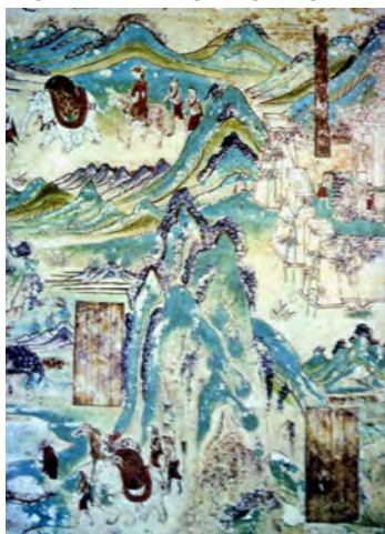
Fig 15. Dunhuang Cave 103 Tang dynasty, Dunhuang Gansu

In the Yang Jingsong's others work, we can also find the inspiration of ancient art and the surrealistic size of the objects, but tells a totally different story. The kitchen sink (Fig.16), filled with water dripping from its faucet, is home to an island: at its crest is a miniscule portrait of the artist and his wife. Spent cigarettes and watermelon rinds float in the surrounding sea; an electric plug immersed in the water dangles off the side of the sink; and near the faucet, toothpaste oozes out of its tube. Yang Jingsong still likes using the pix tradition Blue and Green Tang palette to depict the hills. We can clearly see the three-dimensional of this painting. Another painting, Red Cloud 2004.6 (Fig.17), is