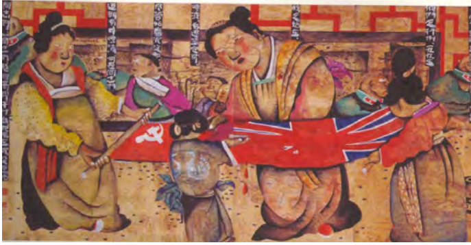
Figure 6, Zhu Wei, b 1966 Comrades , ink and color on paper, 1995