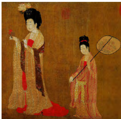
Figure 10 detail of Ladies with Head-pinned Flowers , 46 cm x 180 cm, in the Liaoning Provincial Museum

Court Ladies Playing Double Sixes , (Figure 11) painted by Zhou Fang currently held at Taipei Palace Museum. Double-sixes is a lost chess game that first appeared in China during the Three Kingdoms period (220-280) and became popular in the Sui (581-618), Tang, Song (960-1279), and Yuan (1279-13689) dynasties. 21 In this painting a beautifully dressed woman sits on a stool, looking down at the game board smiling, as the woman opposite her takes her turn. The dignity and elegance are all showed in the cheerful countenances of the ladies and their magnificent clothes. On the contrary, maids look humble with hardly countenance in the court atmosphere. Under the brush of Zhou Fang, the scene of leisure and aristocratic playing seems complex with mixed feelings of joy and sorrow. 22