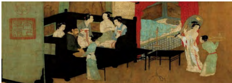
Figure 1.3 The Third Section: Han Xizai and his guests take a rest. Han puts his black coat on.