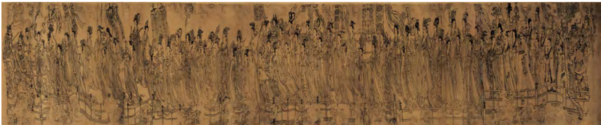
Figure 5. Scroll of Eighty-Seven Immortals , by Wu Daozi, handscroll, ink on silk, 30 x 292 cm, Xu Beihong Memorial Museum, Beijing

Also in the style of Wu Daozi is the Scroll of Eighty-Seven Immortals (Figure 5), measuring 30 centimeters vertically and 292 centimeters horizontally, is currently on display at the Xu Beihong Memorial Museum, Beijing. The painting was a handscroll, painted with ink on silk. The painting depicts 87 Taoist immortals paying homage to the supreme deity. The portrayed images come alive with vivid facial expressions and their dresses and ornaments add a vibrant touch to the painting's artistic appeal. This painting is notable for the painters' imagination and expressiveness with the brush, and is considered one of China's best achievements in line drawing techniques of classical portraits. This is a good example of a composition of outlined figures with black lines. Only black ink and freely painted brushstrokes are used. The lines are vividly expressive and alternately thick and thin, with inner tensions. This painting was in distinct contrast to the other paintings of this era where artists used brilliant color and precise borders used by Wu Daozi's contemporary artists. 12