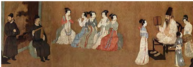
Figure 1.4 The Fourth Section: playing string instruments. Han unties his underclothes.