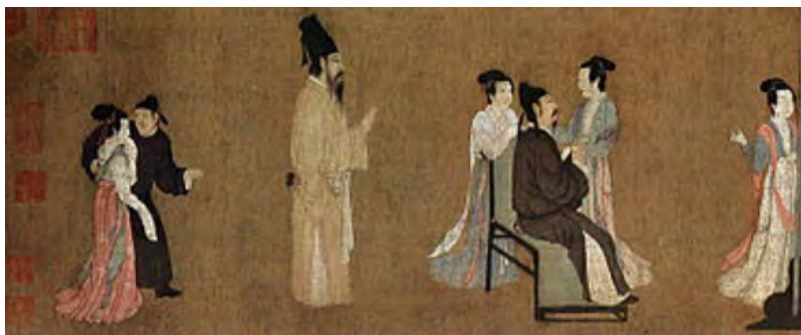
Figure 1.5 The Fifth Section: Han Xizai sees guests off. And, here, you could see Han put his yellow coat on.

After several centuries, even though the Chinese dynasties have changed frequently, the status of intellectuals in society has remained the same. With some thoughts on this question, Wang Qingsong created “ Night Revels of Lao Li ” (Figure 2.1-2.15). 56 Instead of a painting like the original, it is a photograph. Updating each scene of the original scroll, Wang Qingsong presents hedonism as both a form of protest and the best available consolation for the powerless. 57 For