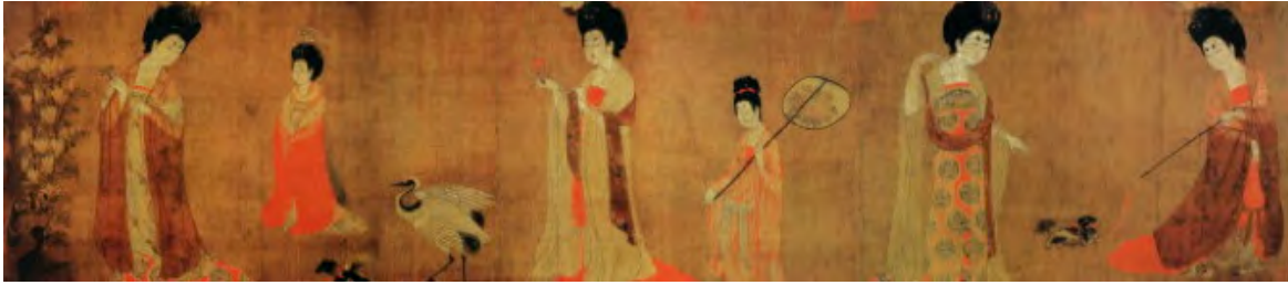
Figure 3 Zhou Fang, Zhou Fang's (c.730-800) Court Ladies with flowers , 46 cm x 180 cm, in the Liaoning Provincial Museum