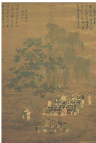
Figure 4, Emperor Song Huizong (1082-1135), Literary Gathering , ink and colour on silk Collection of National Palace Museum.

Left: 134 by 67 cm., 52 3/4 by 26 3/8 in. Right: 134 by 64 cm., 52 3/4 by 25 1/4 in. executed in 1994