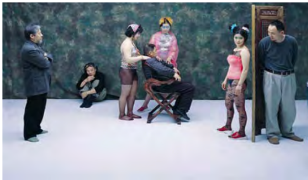
Figure 2.5 Wang Qingsong, the second part of Night revels of Lao Li , 2000 Color photograph, 110 x 960 cm

Wang Qingsong also made New Women (Figure 3) after Zhou Fang's (c.730-800) Court Ladies With Flowers (Figure 4), which is a classical piece in Tang dynasty. This old piece described the decadent life in the imperial court. However, such desperate and dissolute lifestyle was not exciting, since it was separated from the then social realities. Such ecstasy was only playful fun scenarios designed by the noble rich people. 59 Wang Qingsong revisits this painting and refitting it for the contemporary era. He sees a lot of fake nouveau-riche who dress themselves with jewelries and western high fashion brands. They look fabulous, confident and happy. But inside their heart, they must feel very fearful that their hard-earned business and treasures shall end in bankruptcy. 60 So he made the New Women for us to provoke our thoughts. In this image women are depicted wearing gaudy clothing and lingerie, with bright make-up and exaggerated hair styles. It is same false recreation of the ancient art found in Wang Qingsong's the other works.