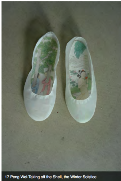
Figure.10, Peng Wei, Take off the Shell, the Winter Solstice

used to generate atmosphere, the entire focus is on the figures and their activity. There is a partial landscape with a mid-section view of two leafy trees and a pair of lovers wraps their arms around the tree trunk. Partially seen from the rear, the male longingly looks at the young woman. One woman wears a red dress and hides her body in the back of the tree. The man wears a blue robe and shows his body to the women. The right sole has an interior view of a room in which a naked woman holds a Chinese pan, or small vertical wind pipes to her lips, another sexual allusion. It is warm and the open door allows a view to a garden with a lotus-filled pool that represents the fecundity of nature. 43