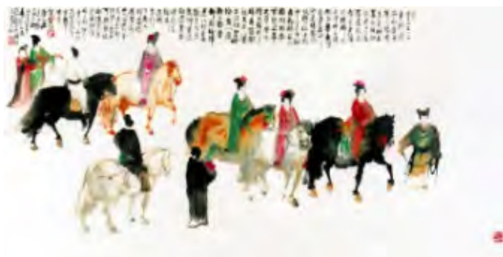
Figure 9, Peng Xiancheng, Beauties , 2011 Ink and color on paper, 70.2 x 137.7 cm

The other painting Coquetry , an over one-meter-tall painting depicting two women dressed in elegant robes frolicking amid blossoming magnolia trees against a bright blue sky and bursts of vibrant color, punctuated by gold-leaf ornamentation that, dazzle the eye. Similarly recall the Tang artist Zhang Xuan's work, Court Ladies Adorning their Hair with Flower (Fig.11 detail). Feminine beauty in the Tang dynasty consists in plumpness, painting eyebrows into butterfly wings, adorning one's high-pile hairdo with peony or lotus flowers. The clothing of all females is very elegant with good details, mainly in red, ocher or white, in a reflection of the esthetic taste. 37 In Peng Xiancheng's painting ladies