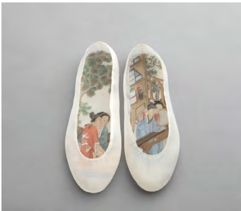
Figure. 11 Peng Wei, Good Things Come in Pairs – no. 20 , 2011-13, silk shoes with painted insoles, 24 x 17.5 x 4.5 cm.

the outdoors. The right shoe depicts a couple playing in the room. The woman covers the man's eyes using her hands and the man holds the woman's arm. The viewer can imagine seduction on the right shoe and resultant climax on the left shoe. Here however, rather than Tang paintings, Peng recalls the erotic colored paintings of the Ming dynasty. Peng Wei uses work to explore traditional concepts and subvert classical motifs introducing elements of the contemporary. Fusing antiquity with modern themes allows the artist and viewer to continually produce thought-provoking pieces.