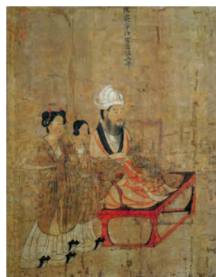
Figure 1.2 Emperor Fei of Chen, 陈废帝陈伯