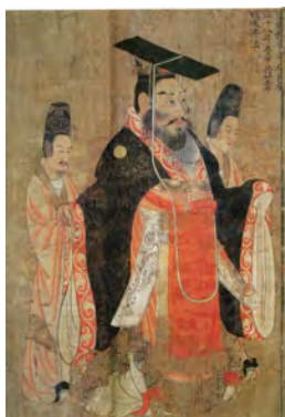
Figure 1.10 Emperor Wu of Northern Zhou, 北周武帝宇文邕