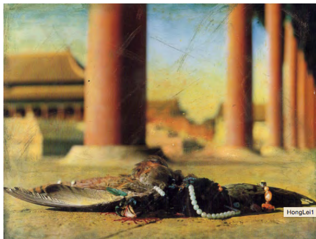
Figure 5. Hong Lei, Autumn in the Forbidden City , East Veranda, 1997 Color photograph, 104.1 x 127 cm

purposes. Hong Lei modeled on the imperial court paintings of the Song Dynasty by using real birds and flowers and arranging them in a composition of the court flower-and-bird painting (Figure 5 and 6) of Song Dynasty with an aristocratic taste. But since he depicted dead birds, the images look sad at the same time. To escalate the “morbid beauty” he found in the historical works, he placed dead birds entangled with bloodstained jade and turquoise necklaces in verandas in the Forbidden City. 61 Employing a ground-level vantage point and a shallow depth of field, Hong has created the sense of infinitely receding space and time, as though the dead bird in the foreground. 62 The dead bird, a common motif in Hong Lei’s work, suggests drama and death at the heart of China’s empire.