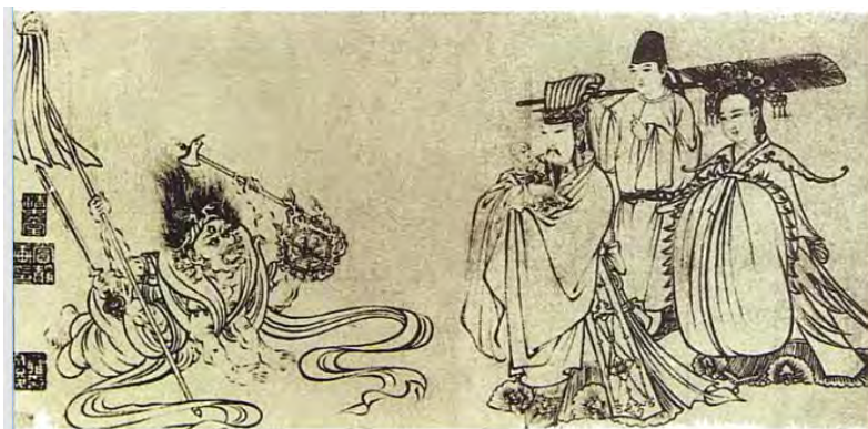
Figure 6, The Presentation of Buddha , by Wu Daozi, ink on paper, and 35.7cm x 338 cm. in the collection of Osaka Museum, Japan.

This illustrates that his painting not only focused on likeness in appearance but also paid great attention to the representation of people's mental state.