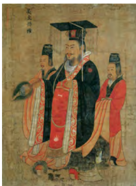
Figure 1.7 Emperor Da of Eastern Wu, 吴大帝孙