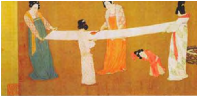
Figure 7, Zhang Xuan, Ladies Making Silk , Tang dynasty eighth century, (later copy), ink and colors on silk, Boston Museum of Fine Arts.

Zhu Wei uses a muted palette, except for the vibrant red, that contributes to a nostalgic atmosphere, while his mastery of ink washes creates unique pictorial transparency and radiant surfaces reminiscent of aged silk. Mounting the panels on vermilion colored silk, Zhu Wei integrates the glaringly brilliant red border into the organic color composition of the painting. Such an inventive and daring use of color, emblematic of Zhu Wei's highly successful works, demonstrates his acute sensitivity to both aesthetics and political symbolism.