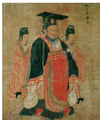
Figure 1.1 Emperor Wen of Wei, 魏文帝曹丕

different character and temperament through the characters posture, attendants, facial expressions, eyes, forehead and lips using a brush ink and various hues of the color red, to express his evaluation of the emperors. For example, Emperor Wen of Wei (Fig. 1.1), a worthy ruler is shown standing, two servants stand beside him. The Emperor Wen of Wei has a well-built and imperial face. His eyes are very serious and severe and his eyebrows are upturned. His clothes are very formal and well-dressed. In contrast Emperor Fei of Chen (Fig. 1.2) was known to not have paid sufficient attention to court matters, so Yan shows him seated and two servants are standing beside him. The emperor Fei of Chen has a pair of soft eyes and curved eyebrows. He has a thin build and friendly face. His clothes are very casual and suave.