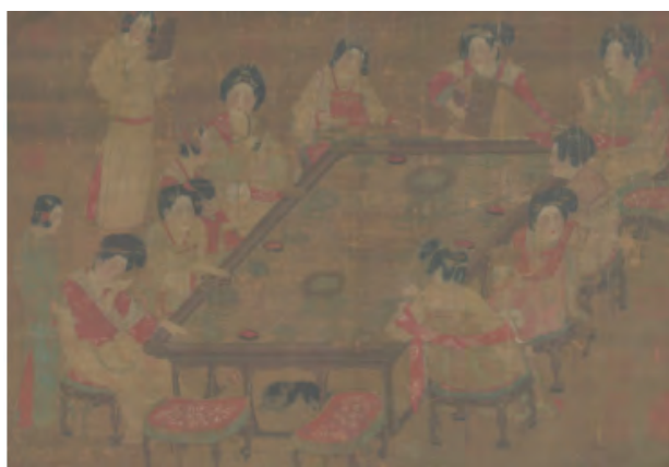
Figure 5, Anonymous, Banquet and Concert, Tang dynasty (618-907), ink and colour on silk Collection of National Palace Museum.