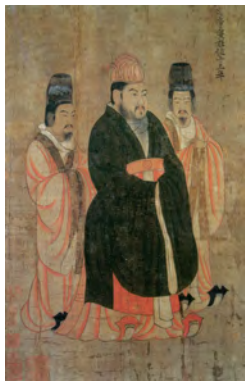
Figure 1.9 Emperor Yang of Sui, 隋炀帝杨广