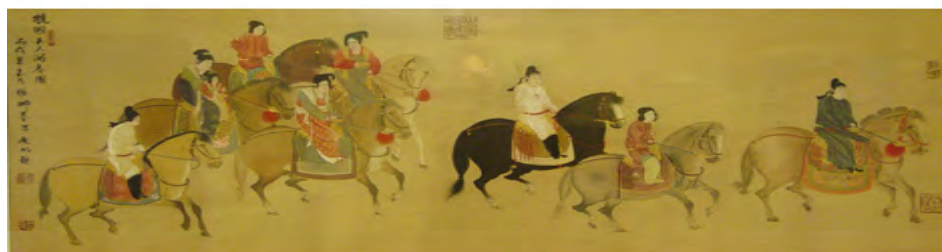
Figure 7, Lady Guoguo on A Spring Outing , by Zhang Xuan, 51.8 cm high, 148 cm wide, ink and pigment on silk, currently located at the Liaoning Provincial Museum.

artists during the Northern Song Dynasty (960-1127). The original painting cannot be found. This painting is a good example for self-confidence and optimism typical of the flourishing Tang Dynasty (618-907).