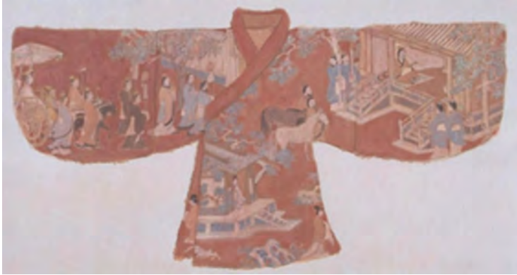
Figure 10, Peng Wei Chinese Robe (2004) Chinese ink on rice grass paper 155 x 85 cm

In her recent works, Peng Wei has created delicate slippers out of pure white silk and using pastel colors and ink painted the inner linings with Chinese erotic scenes. 41 She still uses the gongbi brush techniques. And she chooses the most feminine of shoes as a creative medium and an ancient erotic theme. Putting the ancient erotic painting in the shoes sole is the great-implied meaning. Peng has said: