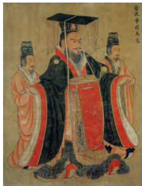
Figure 1.6 Emperor Wu of Jin, 晋武帝司马