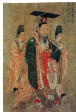
Figure 1.8 Emperor Wen of Sui, 隋文帝杨坚