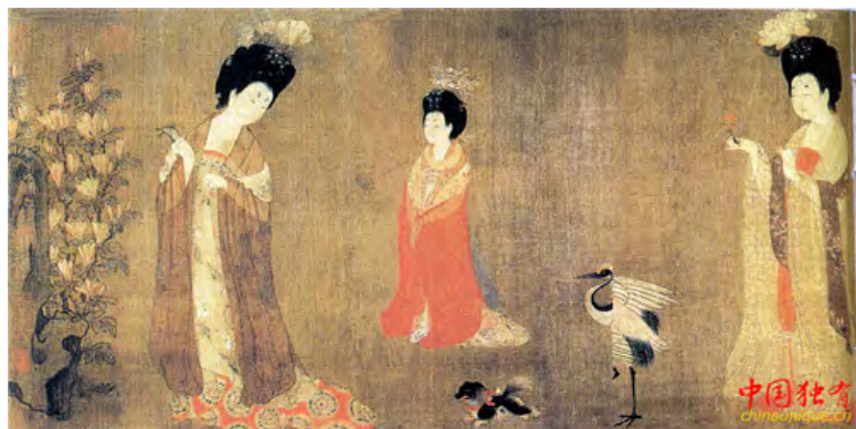
Figure 11, Zhou Fang, Court Ladies Adorning their Hair with Flowers , Ink and color on silk 46 x 180cm, Liaoning Provincial Museum