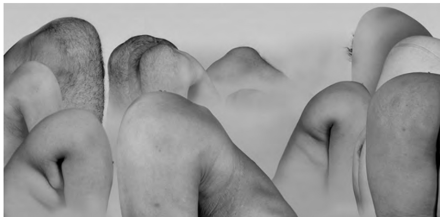
Figure 6 Liu Wei, It Look Like a Landscape , 2004, Black-and-white photograph

Liu Wei's work, It Looks Like a Landscape , (Figure 6) brings out the tension between “veiled” traditional landscape and the “naked” modern body. Unlike classical Western art, ancient Chinese painting offers no space for the nudes; unclothed figures appear only in crude, pornographic. 63 As we have seen, Liu Wei's work, It looks like a Landscape , is a bold attempt in Chinese art. This looks like a traditional Song dynasty monochrome ink landscape (Figure 7). In this photographic image, a traditional gray-toned landscape of jutting hills turns out, upon close inspection, to be composed of cropped nude human figures, bent over to reveal only a sea of backsides. 64