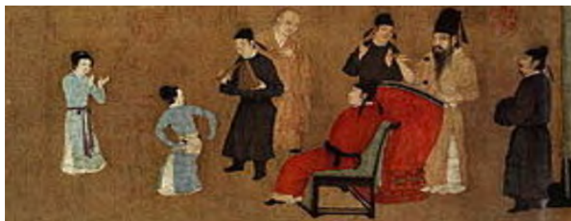
Figure 1.2 The Second Section: Han Xizai and his guests watch dancers.