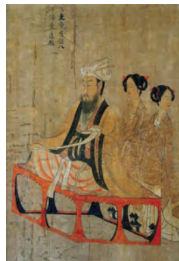
Figure 1.4 Emperor Wen of Chen, 陈文帝陈蒨