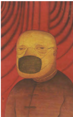
Figure 2, Zhu Wei, “Ink and Wash Research Lecture Series (unfinished)” (2015), ink and color pigment on paper. A New Fine Line at the Metropolitan State University of Denver’s Center for Visual Art.