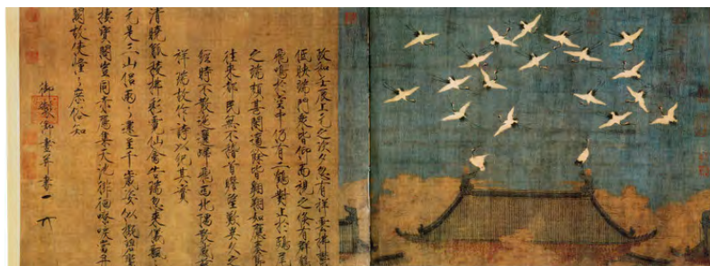
Figure 12, Song Emperor Huizong, Auspicious Cranes , Hand scroll, ink and colors on silk, 51.0 x 138.2 cm. Liaoning Provincial Museum.