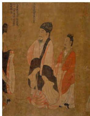
Figure 1.3 Emperor Houzhu of Chen, 北周武帝宇文邕