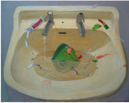
Figure16, Yang Jingsong, Sink 2004.6 (oil on canvas 150cm x 190cm)

similar with the Fig. 14 Yang Jingsong, Shanshui . We can see the though three-dimensional modeling with light green and dark green. The background is red cloud. There is a small airplane and the factory of polluting the air. These large paintings of oversized objects elicit Lilliputian images of a gargantuan race, or the worlds within worlds found under a microscopic lens. 51 His paintings are unique in that they expose intimate and personal views of the world around him in a simple manner. They are not shocking or screaming in color, they are simple renditions of people and objects in his life. 52