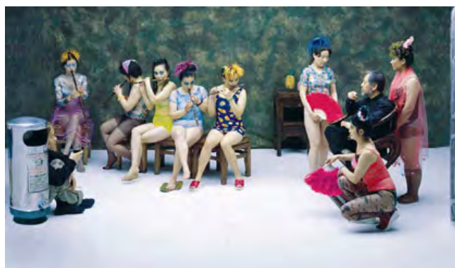
Figure 2.4 Wang Qingsong, the fourth part of Night revels of Lao Li , 2000 Color photograph, 110 x 960 cm