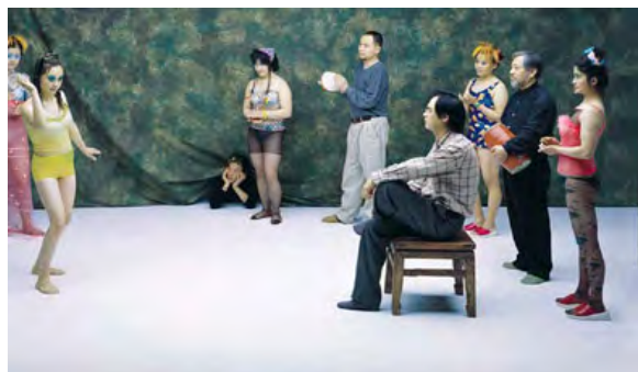
Figure 2.2 Wang Qingsong, the second part of Night revels of Lao Li , 2000 Color photograph, 110 x 960 cm