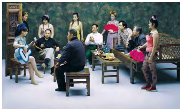
Figure 2.1 Wang Qingsong, the first part of Night revels of Lao Li , 2000 Color photograph, 110 x 960 cm