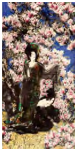
Figure 10, Peng Xiancheng, Coquetry , 1995 Ink, color and gold leaf on paper, 138.5 x 69 cm

in shallow space, close up to viewer, emphasis on delicate drawing of their magnificent gowns and the floral motifs of the garden in which they stand. In contrast to the dull representation of women in the cultural revolutionary posters, this is a return to old ideas of glamour. While many contemporary artists like to use oil painting on canvas, Peng Xiancheng was exploring delicate wash and traditional painting techniques and material.