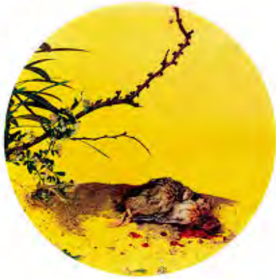
Figure 6 Hong Lei, photo

In another photo he recreated the famous silk fan painting of the Southern Song with their largely empty spaces. Delicate and nostalgic of a lost past they create the sense of loss of the southerners who retreated from the onslaught of the nomadic invaders of the eleventh century. But here nestled in the corner is a small creature, perhaps road kill. The commentary of the loss of a better culture and the rape of the environment is evident. These contrasts are all the more potent because of the contrast of the art of the past and the problem of the present.