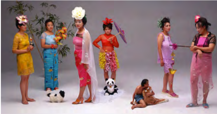
Figure 4 Wang Qingsong New Women , 2000 color photograph, 120 x 220 cm

In sum, Wang Qingsong creates large-scale photographs that explore the rapid changes occurring in China. Inspired by material grounded in classical Chinese art as well as in Western art history, his photographs comment on such topics as rampant consumerism, migration, globalization, and the influence of the West on Chinese culture. Capturing the contradictions of contemporary Chinese life, Wang Qingsong's staged compositions offer a critical consideration of the gulf between the traditional and the modern in China.