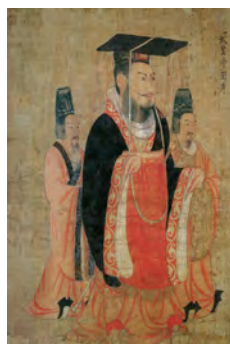
Figure 1.12 Emperor Guangwu of Han, 汉光武帝刘秀