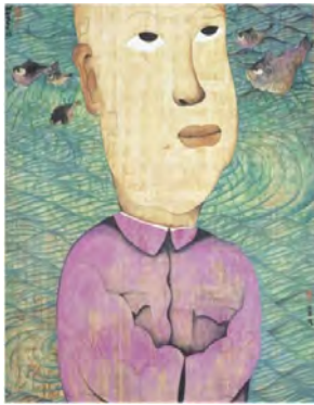
Figure 1, Zhu Wei, “Sweet Life No.21, 1998” ink and color on paper, laid on silk and canvas, 70.3 x 67.5 in.

Zhu Wei investigates the anxieties of modern China's growth, the rapid degradation of the environment and the utopia the revolution sought to establish. His Ink and Wash Research Lecture Series (unfinished) (2015)(Figure 2) depicts an older Chinese man wearing a gray colored surgical mask. He is baldheaded with big nose, glassy eyes, and wears a Chinese traditional shirt with charcoal-colored in a portrait-like fashion. The background is only a red curtain with some black lines. The melancholy figure's face is the only place where the gongbi technique can be discerned. 31 He explored the possibility of reflecting contemporary Chinese political and social life with traditional gongbi (meticulous) ink.