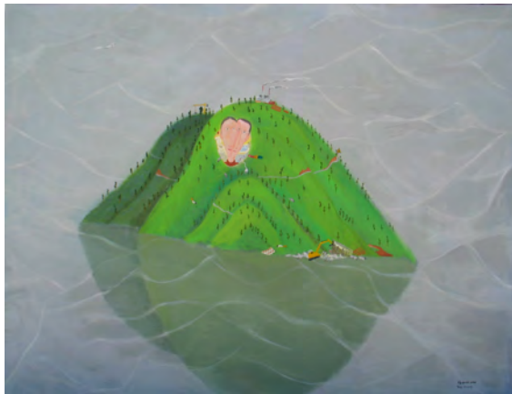
Figure 14, Yang Jingsong, Shanshui