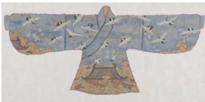
Figure 13, Peng Wei, Chinese Robe (2007), 155 x 85cm Chinese ink on rice grass paper

While Peng Wei has focused her work on garments and shoes, she has expanded by applying traditional painting techniques onto three-dimensional objects. Hers work Body Series 2007-2011 are composed in plastic mannequins and Xuan paper, which are two easily accessible materials. It is clearly considered a sculptural work, however, the artist is still painting on Xuan paper. The plastic