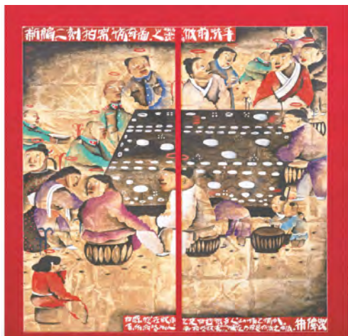
Figure 3, Zhu Wei, Pictures of the Strikingly Bizarre-Hand-Washing Ritual, ink and color on paper, mounted on silk and panel, diptych, framed.

Left: 134 by 67 cm., 52 3/4 by 26 3/8 in. Right: 134 by 64 cm., 52 3/4 by 25 1/4 in. executed in 1994