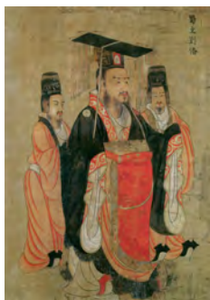
Figure 1.11 Emperor Zhaolie of Shu, 蜀昭烈帝刘备