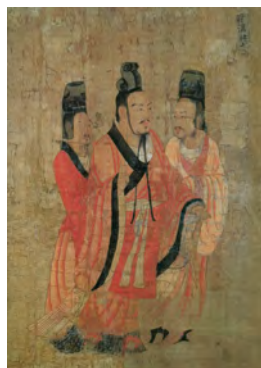
Figure 1.13 Emperor Zhao of Han, 前汉昭帝刘弗陵

Another important work by Yan Liben is Bunian Tu (also called Emperor Taizong Receiving the Tibetan Envoy )(Figure 2). It is one of the top ten traditional Tang dynasty Chinese paintings. It features elegant and bright colors, smooth and vigorous lines. The painting is a representative piece of paintings from the Tang dynasty, and possesses both historical and artistic value. Bunian Tu records the grand occasion of envoys from Tufan (in the present-day Tibet) coming to Chan'an (present-day Xi'an), the Tang Capital to ask for the permission to marry princess Wencheng in 490AD. On the right side of the painting, the Emperor is sitting on the royal sedan by six women. Two more women carry huge fans and another holds a red parasol. Standing at attention are a Chinese protocol officer in red, the Tibetan envoy Lu Dongzan in brocade, and a court attendant in white. The Taizong emperor is the focus of the painting. He looks solemn with a perfect composure and graceful with a deep forward sight, full of majesty of an emperor in the reign of great prosperity. 4 On the left, the first person is the official in the royal court, the one in the middle is the envoy and the last one is an interpreter. The painter