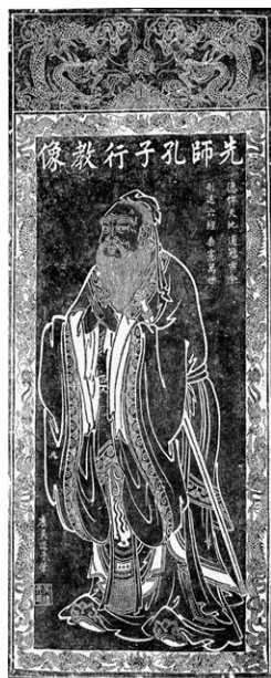
Figure 4. The Portrait of Confucius , rubbing of an engraving after Wu Daozu, eighth century, Qufu, Shandong Province. (After Native Place of Confucius , Kong Yanglin, ed. [Zhejiang peoples Press, 2000]:98)

Wu Daozi drew many art works in his life. The Portrait of Confucius , (Figure 4), Wu Daozi made for the Qufu Confucius Temple in Shandong, an image of Confucius holding jade tablets, which were used to designate feudal rank; it became quite famous. 10 A rubbing of an image attributed to this artist shows the sage as an old bearded man; he turns to the right and slightly inclines his body. Wearing a long, formal court robe with an ornate border and a small cap on his bald head, he clasps his hands together. 11